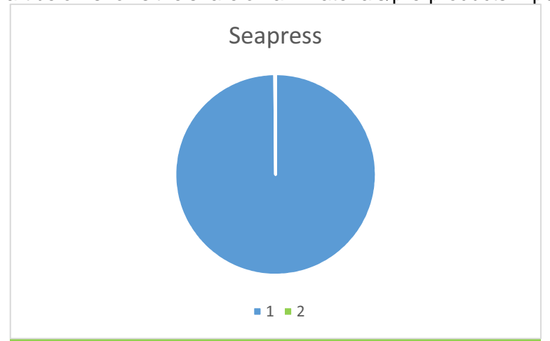
Illustration 2 Percentage of individual materials per declared unit

The chart below shows the share of raw materials/pre-products in percent.